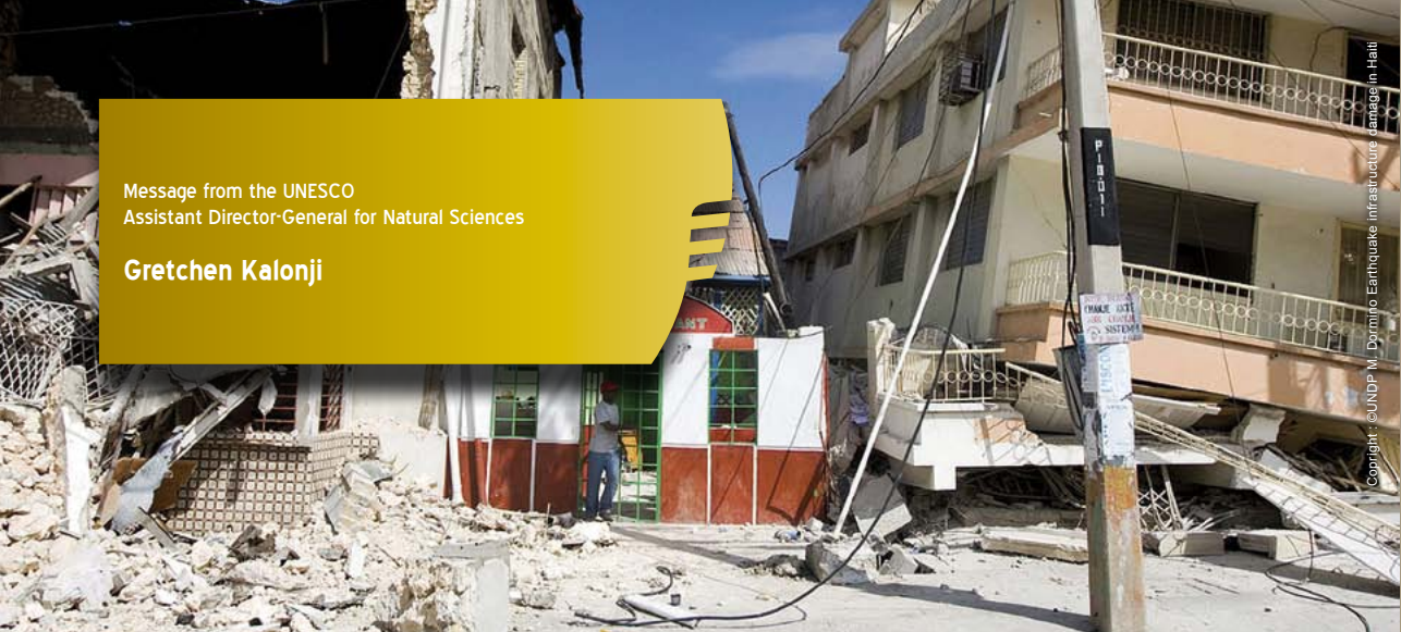
Earthquake Infrastructure Damage in Haiti