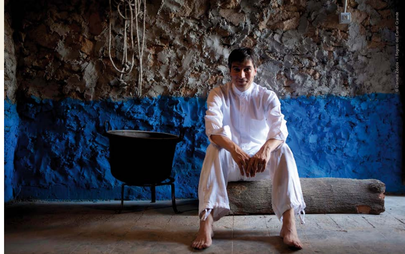
I Segreti del Canal Grande